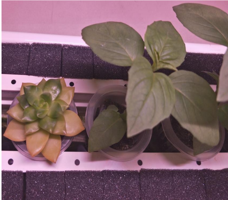
Figure , Several herb crop grow on O2-Light.